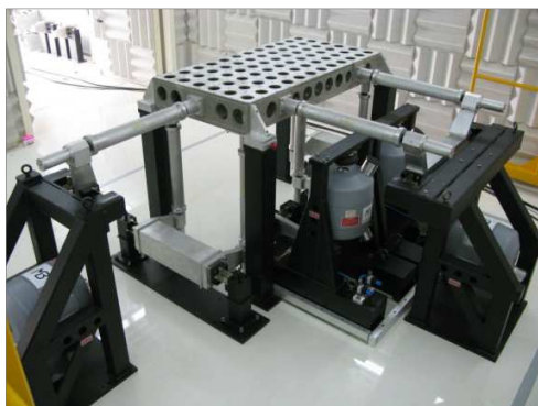
Simultaneous 4/5 DOF